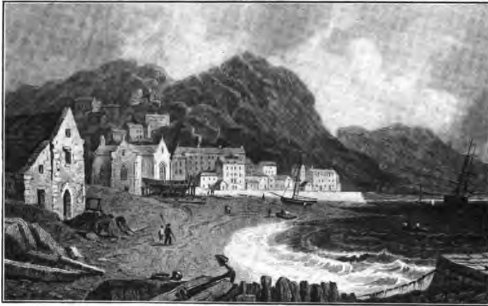
ABERMAW, OR BARMOUTH VILLAGE